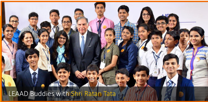
LEAAD Buddies with Shri Ratan Tata