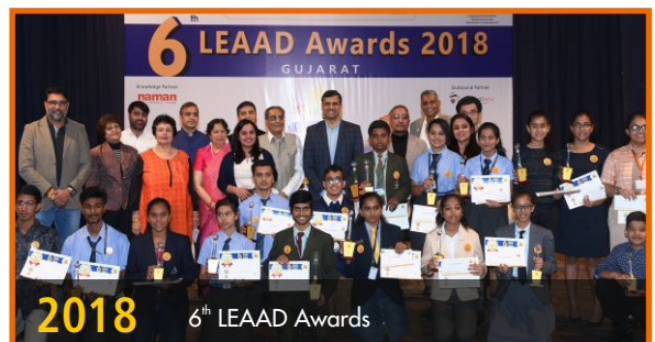
2018 6 th LEAAD Awards