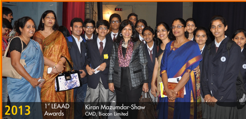
2013 1 st LEAAD Awards Kiran Mazumdar-Shaw CMD, Biocon Limited