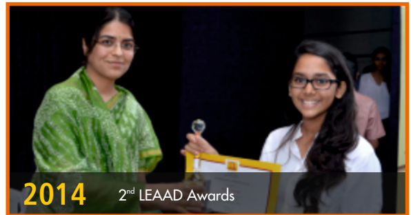
2014 2 nd LEAAD Awards